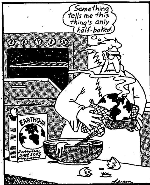
In God's kitchen

Sunday 9 February at The Channon Hall 3pm ( the day of the market)